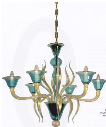
CRISTAL STUDIED DECORATIVE COLUMNS, ANIMALS AND TABLE BASES ARE ALSO AVAILABLE