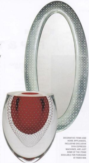
DECORATIVE ITEMS AND HOME APPLIANCES, INCLUDING EXCLUSIVE OIVA ESPRESSO MACHINES, ARE JUST SOME OF THE ITEMS AVAILABLE FOR PURCHASE AT FABIO BKK.

Some samples from the latest collection include crystal studded decorative columns, animals and table bases. Furniture such as tables and chairs, cabinets and sideboards are available. He offers around 60 styles of handmade walnut and beech chairs