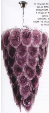
IN HOMAGE TO ITALIAN GLASS MAKING, THE SHOWROOM CARRIES A RANGE OF MURANO GLASS-FRAMED MIRRORS, RANGING FROM THE TRADITIONAL TO THE MODERN